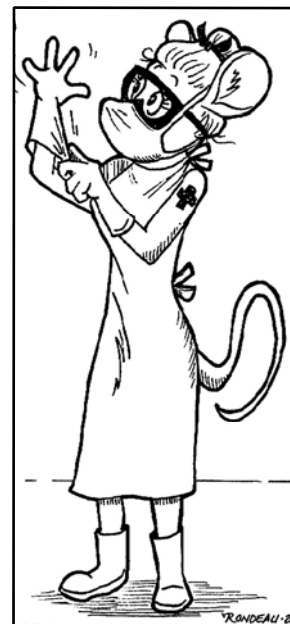
ASFACTS, July 2021

Orndorff was a patron of the arts, often buying pieces at Bubonicon and also providing candy to art show volunteers and staff; enjoyed the music